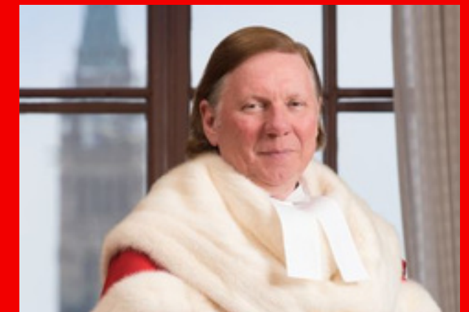
Justice Malcolm Rowe (2024)