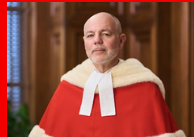
Justice Russell Brown (2023)