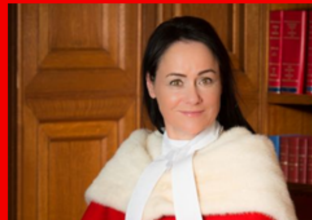
Justice Suzanne Côté (2022)