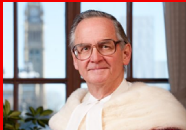
Hon. Ian Binnie (2015)

With its track record as a rigorous, intellectually diverse, and enterprising legal forum, the Runnymede Society is proud to organize the annual Law & Freedom conference. Over the years, Law & Freedom has hosted renowned presenters from private practice, the academy, and the bench, including past and sitting judges of the Supreme Court of Canada: