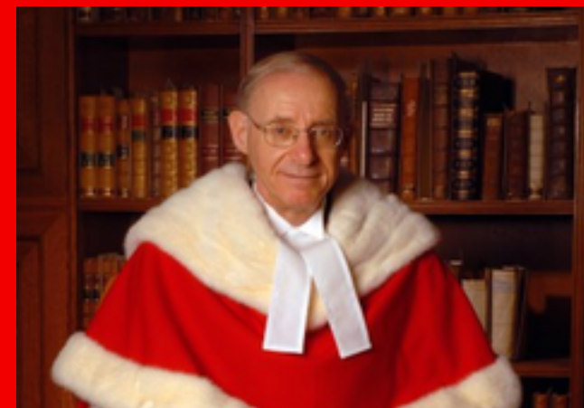
Hon. Marshall Rothstein (2020)